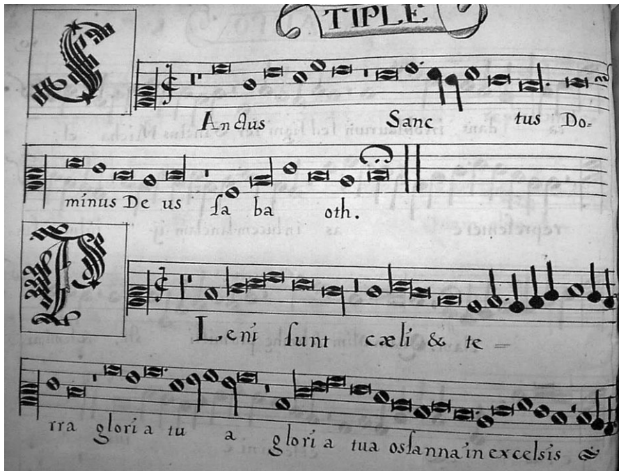
2 Francisco Guerrero, Sanctus from Requiem Mass (1566 version) (MEX-Mc 2, f.50v) (detail)

1589 inventory. This Mass anthology, one of the few in the 16th century to contain specifically 20 Masses, included works not only by Josquin, but also by Sermisy, Gascogne, Manchicourt, Mouton, Richafort, Divitis, Prioris and Gombert, among others. Other ecclesiastical archives that held this edition included those of Burgos, the Royal Chapel in Granada, the collegiate church of El Salvador in Granada, Jaén, Plasencia, Tarazona and Zaragoza. 27